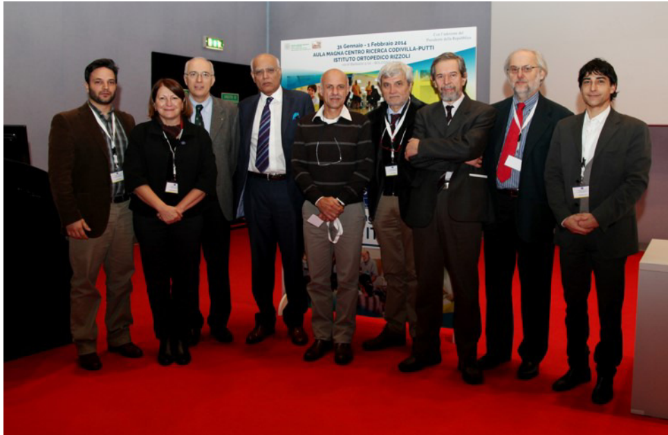
ISPO Italy Board of Directors who organized the first National Congress